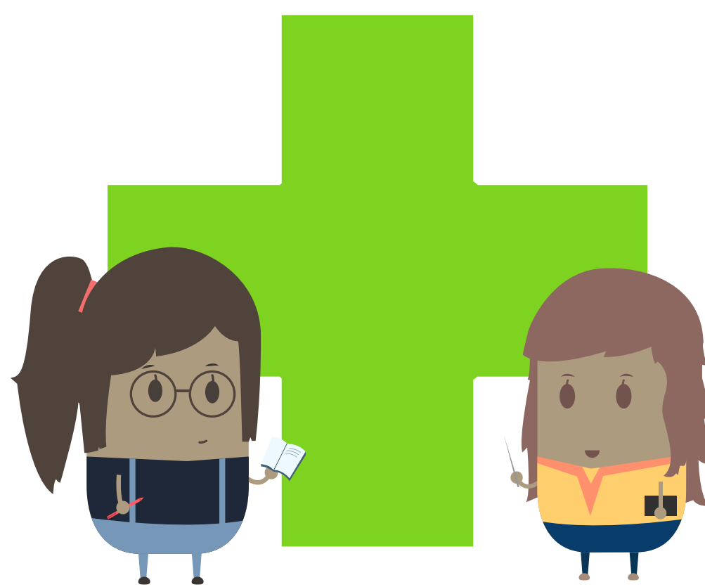
Taking a moment for health education and promotion