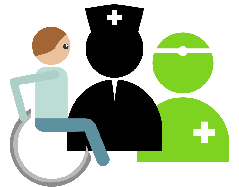
Collaborating with healthcare team for discharge