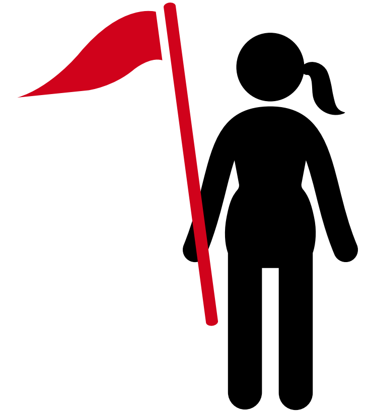
Patient's autonomy/ independence