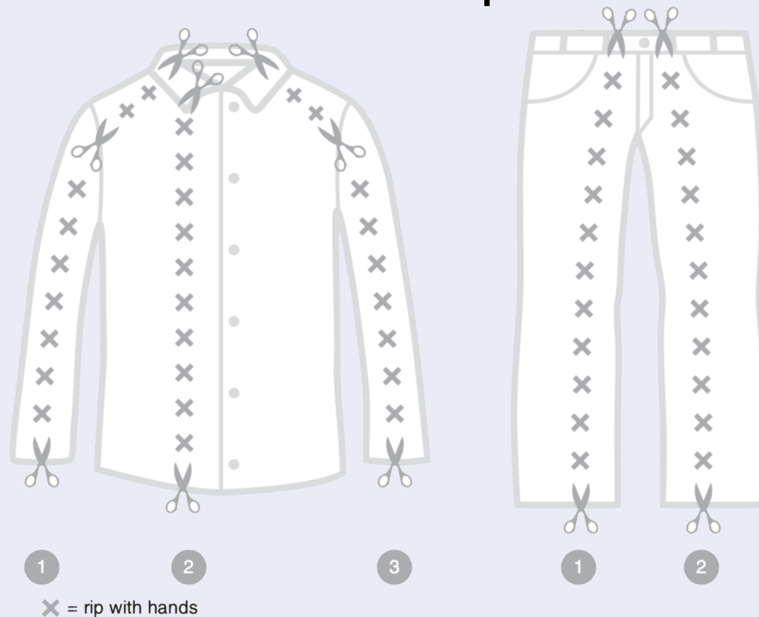
Cut and Rip