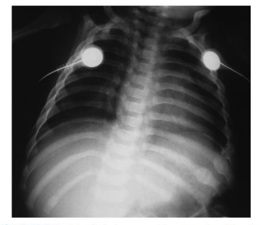
Figure 66-8. Posterior rib fractures caused by compression of the ribs from child physical abuse.