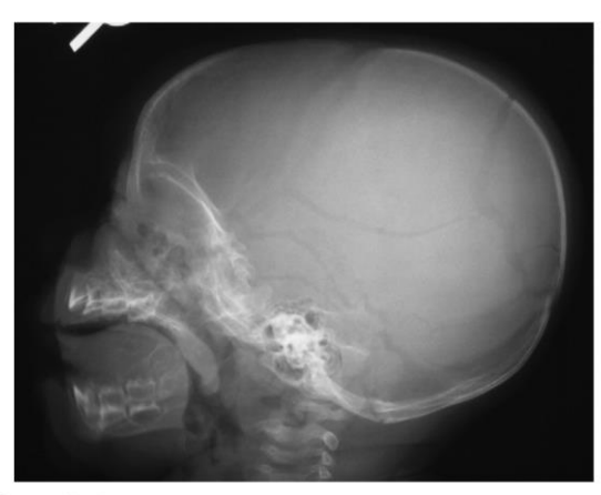
Figure 66-6. Complex skull fracture associated with child maltreatment.